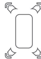
SG Grip™ System