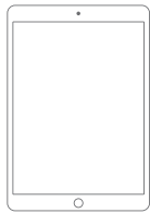
iPad Air 2 16GB 64GB 128GB

Maroo 3109 NE 109th Ave. Vancouver, WA 98682 360-883-0333 phone 360-883-4888 fax